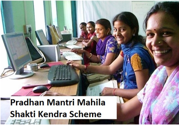
Pradhan Mantri Mahila Shakti Kendra Scheme