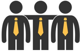
Limited Liability Partnership