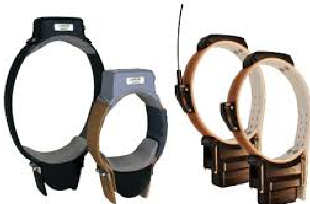
IndiumTrackM from Lotek